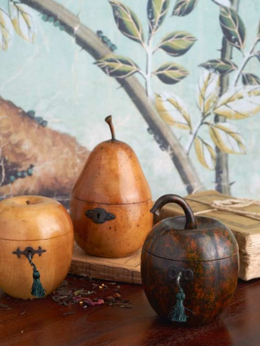
Above Apple TEA CADDY , £3,650; fruitwood pear TEA CADDY , £3,850; melon TEA CADDY , £7,750, all Hampton Antiques. Circular DINING TABLE , £1,395, Orchid Furniture. BOOKS , as before Facing page Early 19th-century Tunbridge ware TEA CADDY , c1825, £5,500, Hygra. Red CABINET , ref ZH14-1B, £790, Orchid Furniture. Large lustre BOWL , £36; small lustre BOWL , £28, both Green & Stone. 'Dorado' bread PLATE (under large bowl), £7.99, Zara Home. TEA , as before