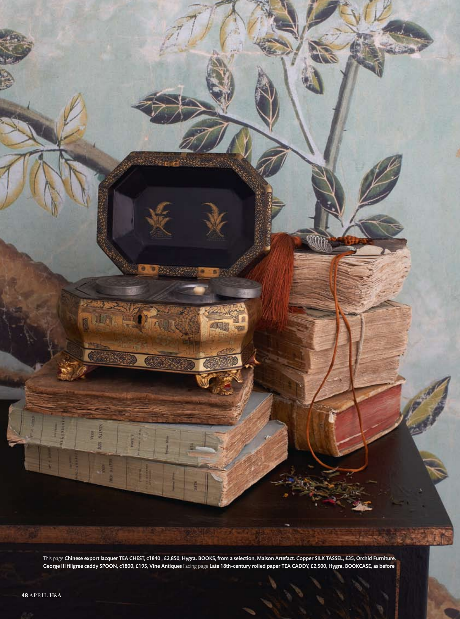
This page Chinese export lacquer TEA CHEST, c1840, £2,850, Hygra. BOOKS, from a selection, Maison Artefact. Copper SILK TASSEL, £35, Orchid Furniture. George III filigree caddy SPOON, c1800, £195, Vine Antiques Facing page Late 18th-century rolled paper TEA CADDY, £2,500, Hygra. BOOKCASE, as before